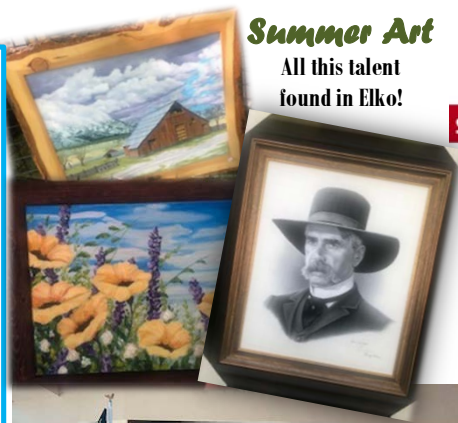
Summer Art All this talent found in Elko!

Monday, Wednesday, and Friday; we have social time on an internet portal called Zoom. We would love for you to join us in conversation and fun! Zoom is a portal that allows you to see and talk to one another and share. If you need help setting it up on your mobile device, laptop, iPad, or tablet, give us a call at 738-3030 and we will be happy to make arrangements to walk you through the steps. (Instructions are also provided at drive-thru) Monday/Wednesday Social: 1:00-2:00pm Fridays: 12:00-1:00 pm Meeting I.D Number: 98340405722 Password: 4PHqDa Tuesday Bible Study: 1:00-2:00pm Meeting I.D Number: 97148037295 Password: 5ZncbJ